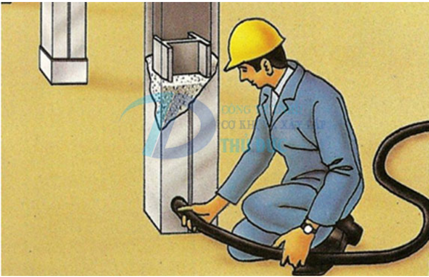
Lightweight flooring, heat resistant: